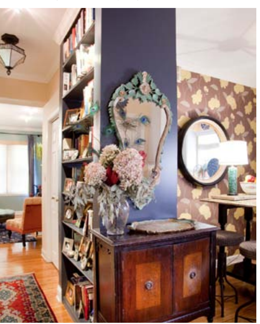
DRAMATIC DIVIDER The floor-to-ceiling bookshelf features good storage on both sides. The piece replaced a less attractive, nonfunctional pass-through. With its elegant deep blue, almost-black color, the bookshelf attracts visitors' attention and gives the room a sophisticated ambience.